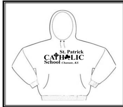
Navy Hoodie / White Font