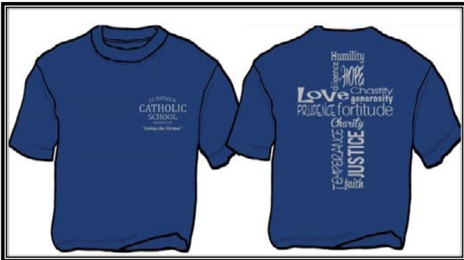
Slate Blue Tshirt / Gray Font "Living the Virtues"