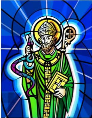
St. Patrick, pray for us.

You may be joining with others to pray at church; or praying the novena in your homes, the chapel, in the car on the way to work, etc., but we will be united as one in this effort for God's will for our parish home.